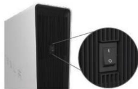
Powerwall On/Off Switch

If your Powerwall system stops producing power, it may have been overloaded or run low on energy and entered a standby state. To restart your system, ensure that all energy intensive loads (see page 1 for examples) in the home are turned off to reduce the amount of power needed. You can initiate a restart by toggling the on/off switch on any Powerwall in your system. Remember to leave the Powerwall switch in the ON position to maintain connection to the Gateway.